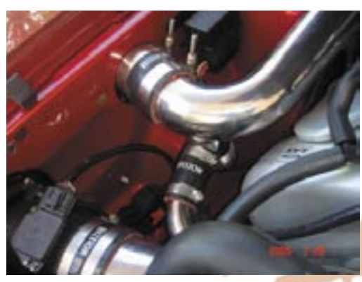
104. Position all intercooler pipes and tighten all clamps. 105. The next step is to connect the valve covers to the 4" inlet. Take supplied 3/8 hose and connect it to the PCV valve on the driver side valve cover. Route 3/8 line to supplied 3/8X1/2X1/2 tee and connect tee to the small hose on the passenger side valve cover. Next connect 3rd leg of tee to the ½" stub on the polished 4" inlet pipe.