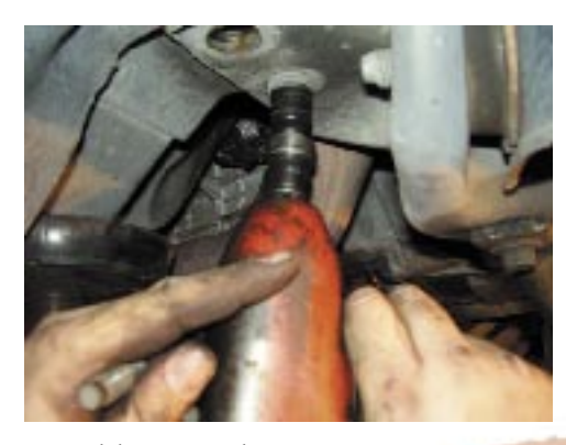
20.Remove old K-member