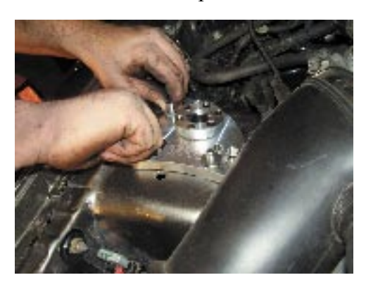
34.Install strut with coilover kit into caster/camber plate, using caster camber instructions as reference for bearing/shim stacking order.