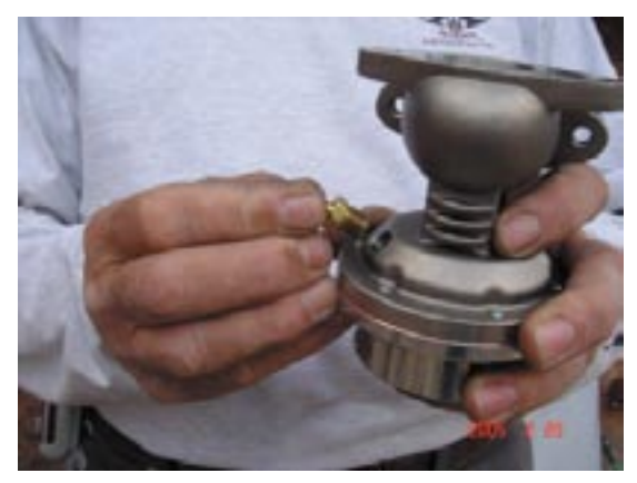
66. Install wastegate, using supplied gasket and bolts. Bolt wastegate to inlet pipe with supplied 8mm socket head bolts. There is no gasket between wastegate and the main pipe. Bolt wastegate outlet pipe to wastegate using gasket and supplied 5/16" socket head bolts. Leave bolts loose.

65. Install supplied 1/8" pipe barb into the underside of the wastegate. (SEE PIC). This is very important. The fitting must be on the correct side for proper operation. An incorrect installation will over boost the engine.