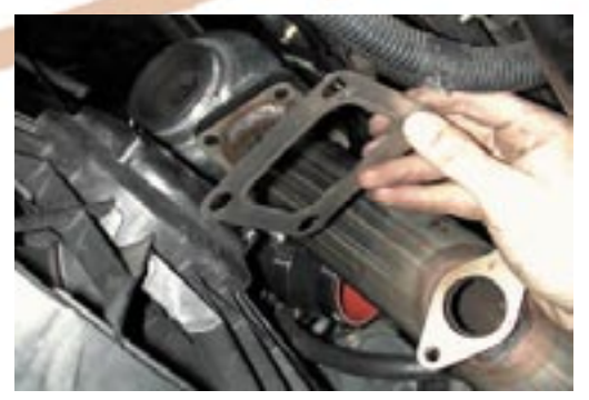
63. P/S line will need to be bent towards engine to make clearance for down pipe.

62. Next, install (4) bolts that secure Turbo to main pipe, using steel shim gasket between turbo and pipe. Leave bolts loose.