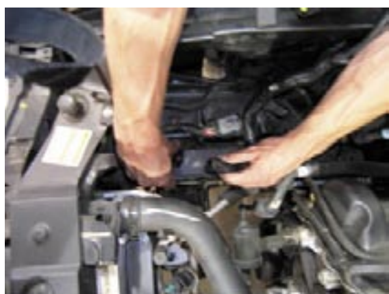
42. Reconnect (5) connectors through air inlet hole. This will open up the smaller hole in the fender, allowing installation of boost inlet tube.