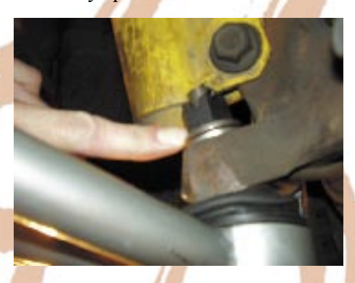
36.Re-install factory ABS sensor, steering linkage, brake rotor, and calipers

37.Re-install Sway bar and end links, re-install ground strap to frame using supplied self-tapping screw, and install supplied oil filter.