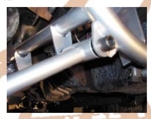
27.Install motor mounts nuts and tighten to 110 ft. lbs.