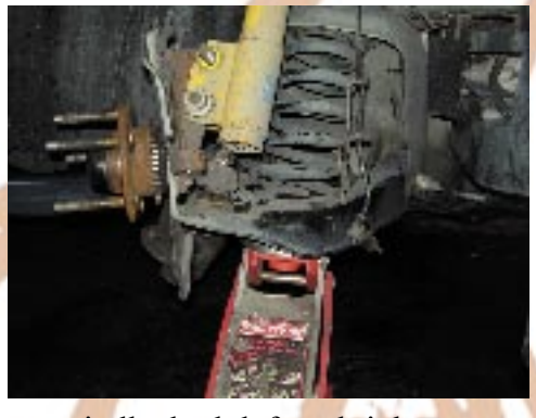
16.Remove spindle, both left and right