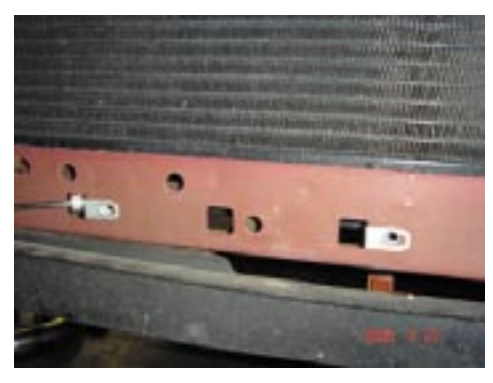
92. Install intercooler with supplied metric bolts. Bolt it to lower radiator support, leaving bolts loose.