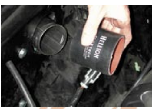
100. Install 4"turbo inlet pipe, Massair meter, and filter onto turbo inlet. Make sure that the flow is correct and the air filter is secured to the end of the meter. Leave clamps loose until final intercooler pipe fitment.