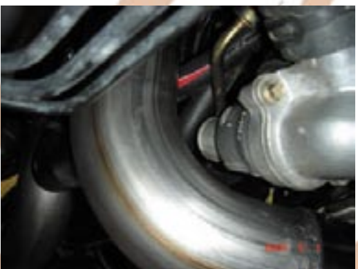
Oil Feed Line

81. Install 47" oil feed line from turbo oil inlet to the underside of the oil filter mount. Route line away from hot pipes & moving parts. Secure with supplied zip ties.