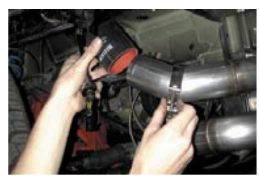
99. Install intercooler pipe #3 and silicone hose.