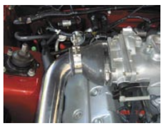
103. Bolt Blow Off Valve to Stub off of inlet tube. Install blow off valve outlet to stub on the 4-inch tube inlet, using 1 3/8 silicone hose and supplied clamps.