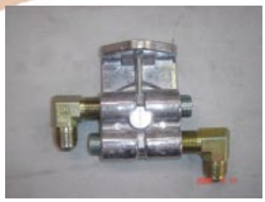
116. Install adapter onto engine and tighten