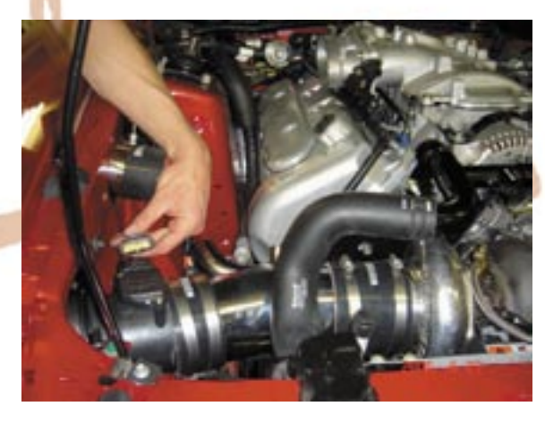
102. Install intercooler pipe #4 and 2.5" by Oval silicone hose adaptor to throttle body.