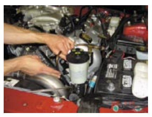
64. Hang down pipe to exhaust housing using supplied V-band clamp. Leave clamp loose. (Heat shield not shown with pic)