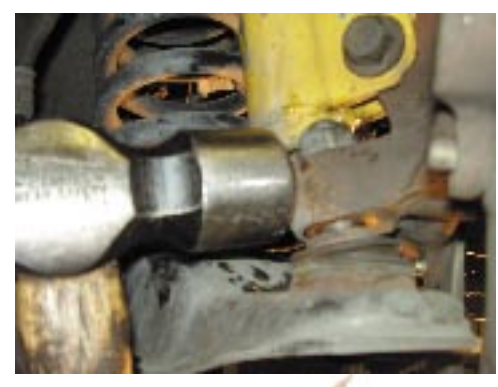
15. Support A-arm with jack to take load off of spring and remove the 2 strut to spindle bolts, then lower A-arm, being cautious because spring is under pressure.