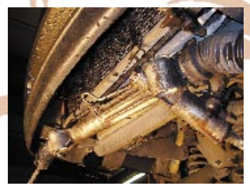
10.Remove brake calipers left & right