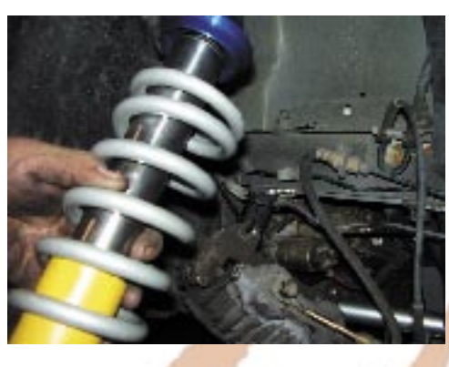
35.Re-install factory spindle and hub assembly and retorque to factory specs