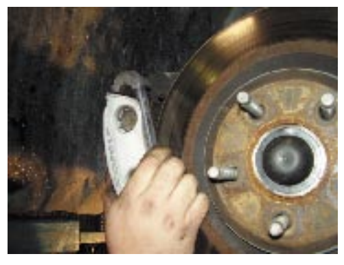
11.Remove both front discs