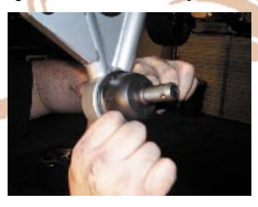
29.Install steering rack, install rack bolts and tighten

28.Install grease boots on lower ball joints