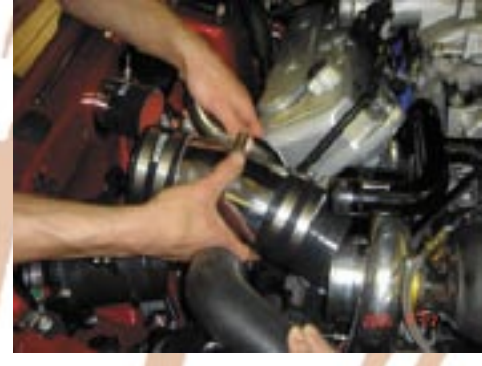
101. Re connect mass air meter, and plug in air temp sensor inside inner fender.