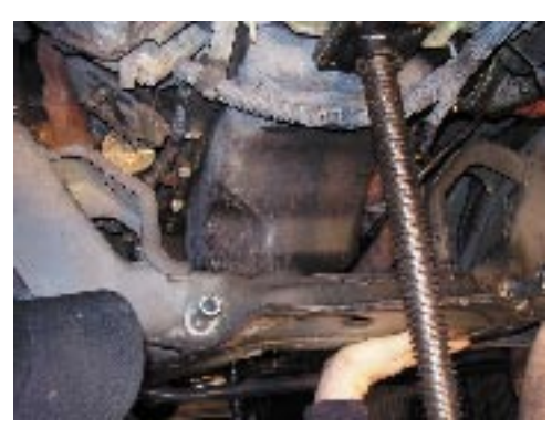
19.Support K-member and remove K-member bolts (6) attaching K-member to frame.