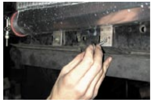
93. Install intercooler support strap, hang strap from hood latch and secure with supplied 5/16" hardware.