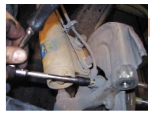
13.Loosen lower ball joint 15/16 nut (both left and right) until there is a 1/8 inch gap with the nut maintaining full thread engagement.