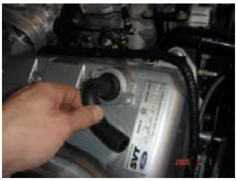
106. Attach the supplied vacuum line from the turbo compressor to the underside of the wastegate.