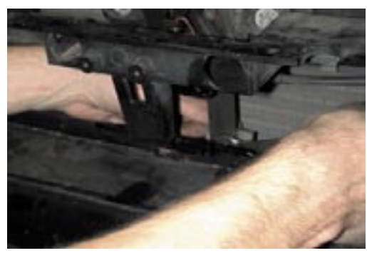
94. To mount Power Steering cooler, either bend power steering cooling line to reach front tab on intercooler, OR Cut 3/8" PS feed and return lines. Install supplied line and splices to extend cooler to reach front of intercooler.

95. Once bent or extended, bolt it to intercooler. 96. Install intercooler pipe #1 from turbo to lower intercooler inlet. Slide 2 ½ inch clamps over pipe first to ease installation. Tighten clamps.