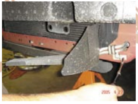
91. Relocate PS cooler line clip to other slot in radiator support.