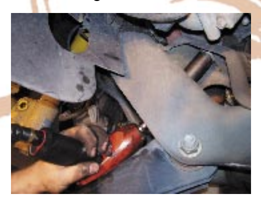
18. Support engine and transmission with appropriate upper support tool or support from beneath.

17.Remove left and right motor mount nuts