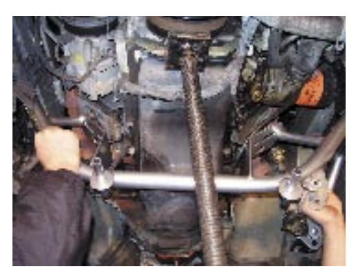
25.Install bushings and sleeves into tubular A-arms, making sure that the short sleeve is in front, and the long sleeve in back