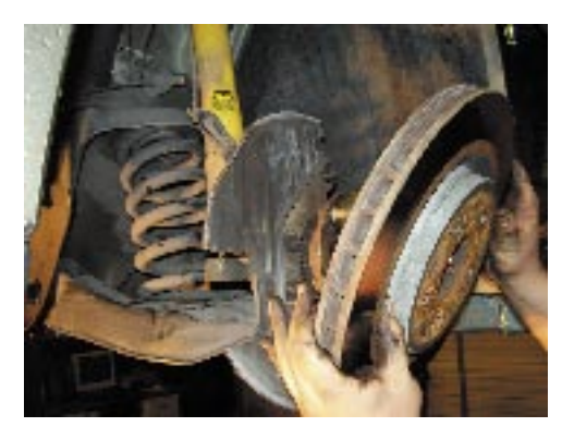
12. Remove ABS sensor lines both left and right