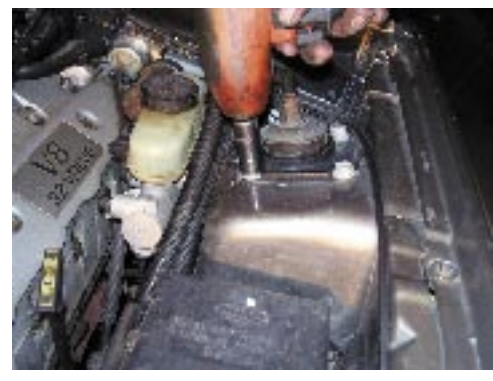
32.Remove plate from strut by removing large nut on top of strut shaft