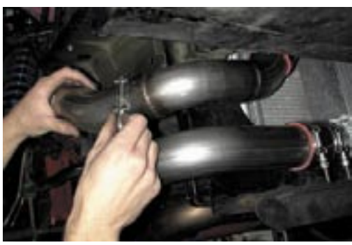
98. Install silicone hose and clamps.